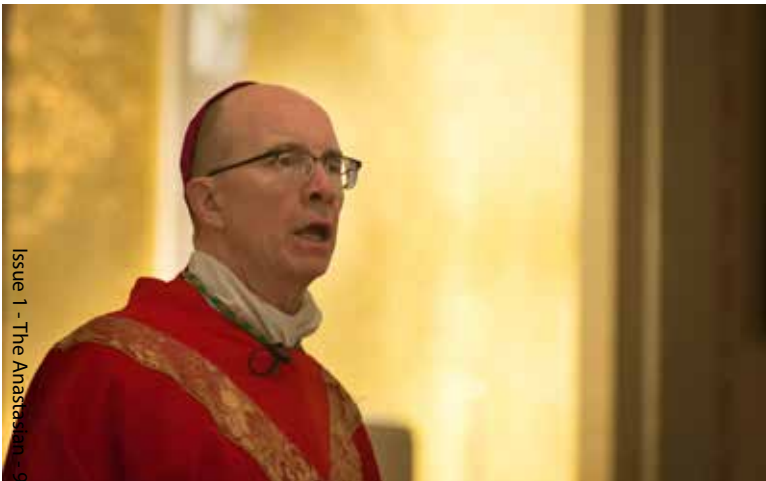
Issue 1 - The Anastasian 3

The children, as part of their preparation, had performed many of the Corporal and Spiritual Works of Mercy. They had also spent much time selecting and researching their saint's names and offered all these actions up in the Mass.